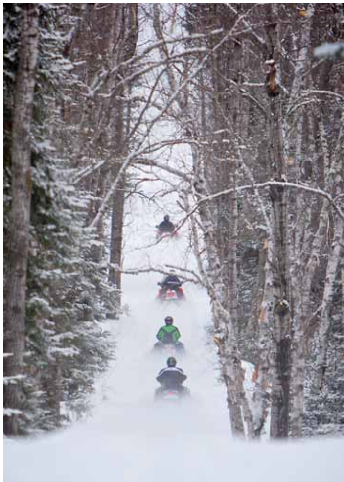
Gunflint Trail

NEED A GIFT IDEA FOR CHRISTMAS, BIRTHDAY OR GRADUATION?